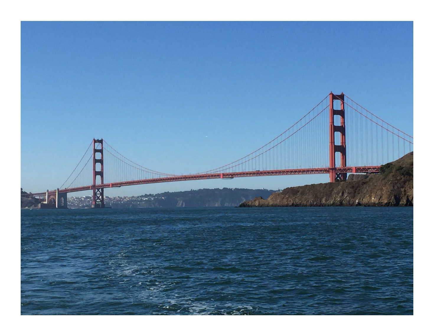
Fourth Quarter 2015